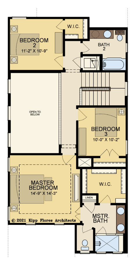
OPTIONAL FIREPLACE AT SECOND FLOOR